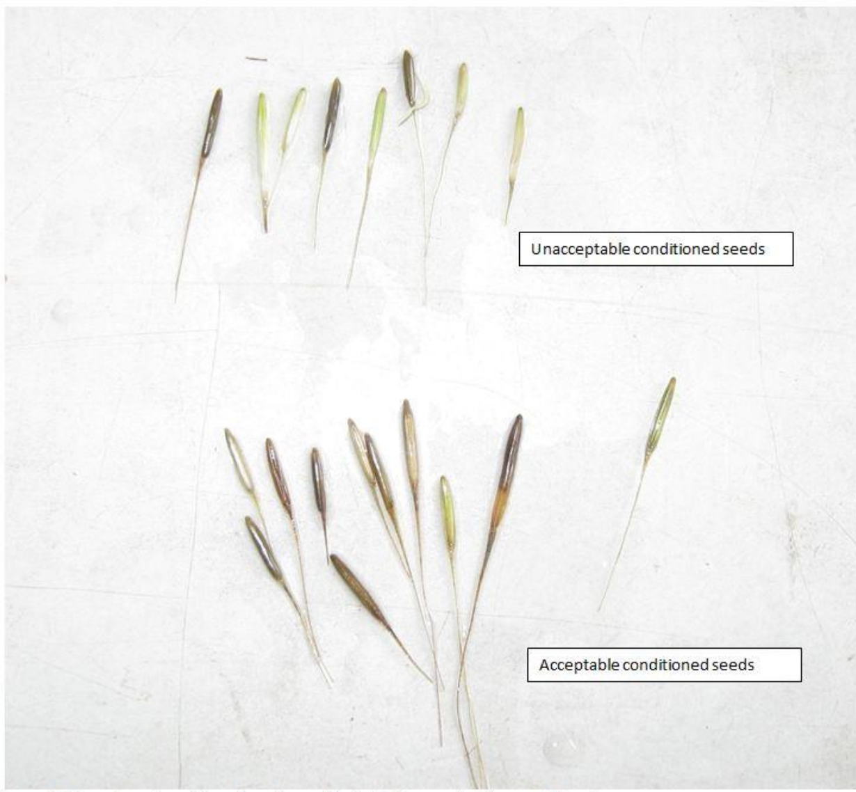
Image 1. Examples of conditioned seeds used for initiating germination growth tests.