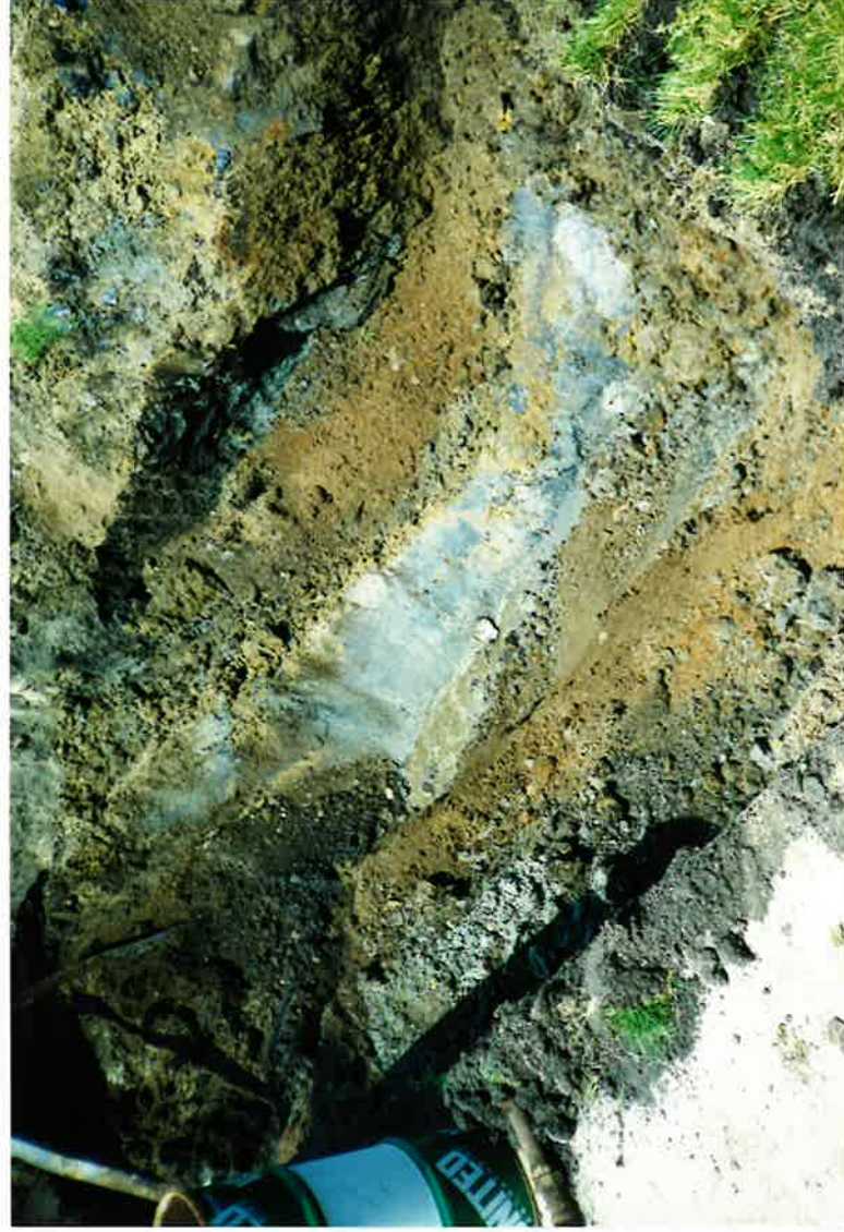
Martin County West High School Excavation base - removed 6,000 gallon tank