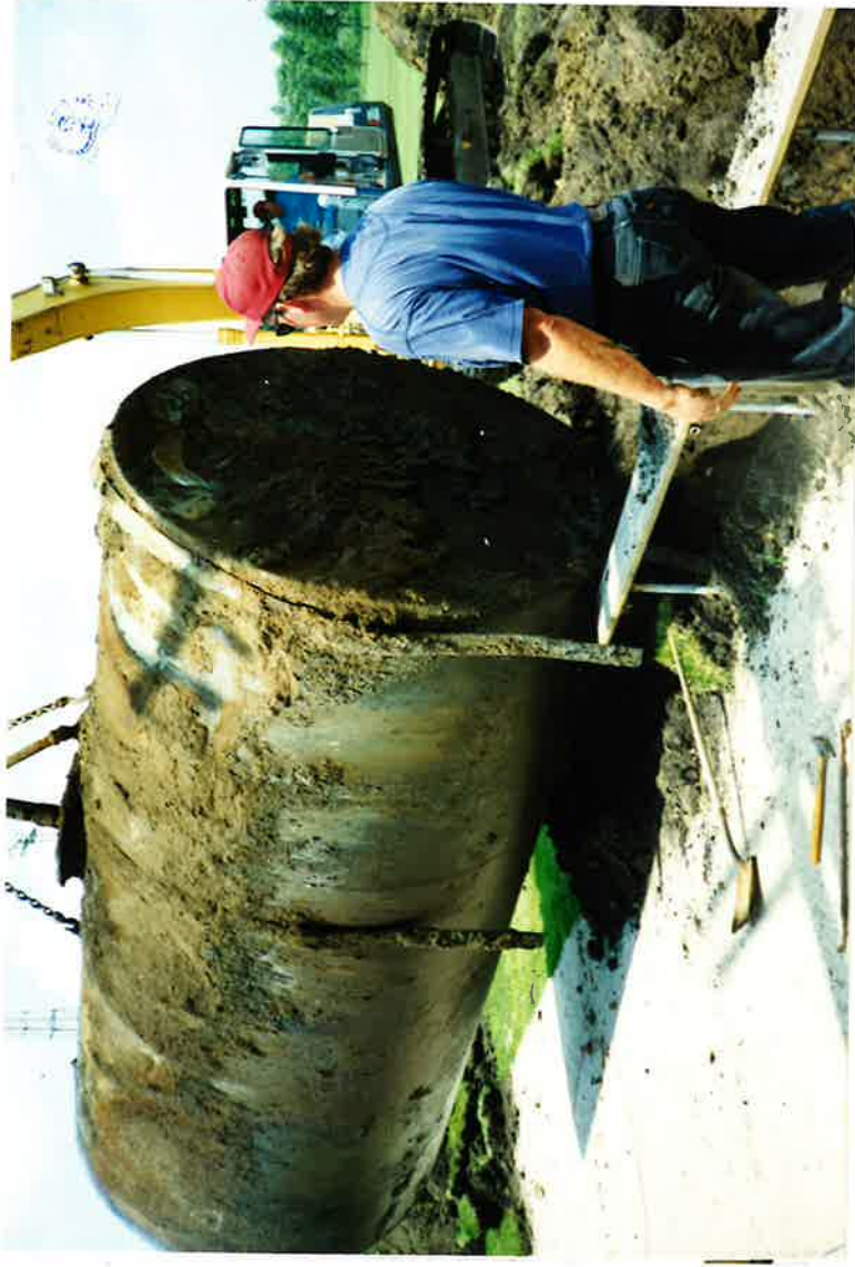
Martin County West High School Removed 6,000 gallon tank