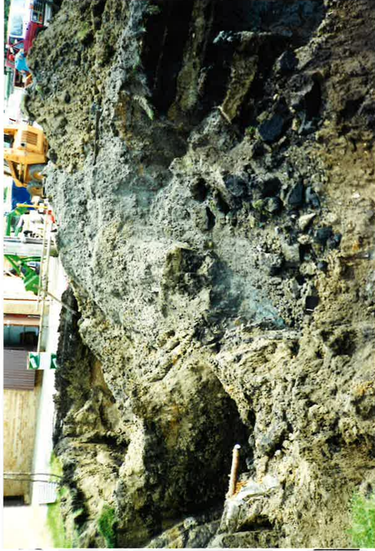
Martin County West High School Petroleum contaminated soil returned to excavation