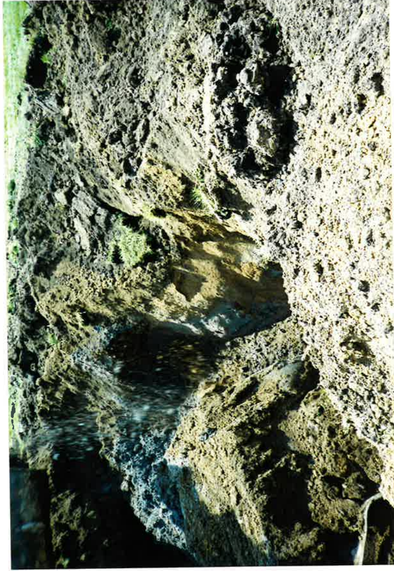
Martin County West High School West end of removed 10,000 gallon tank