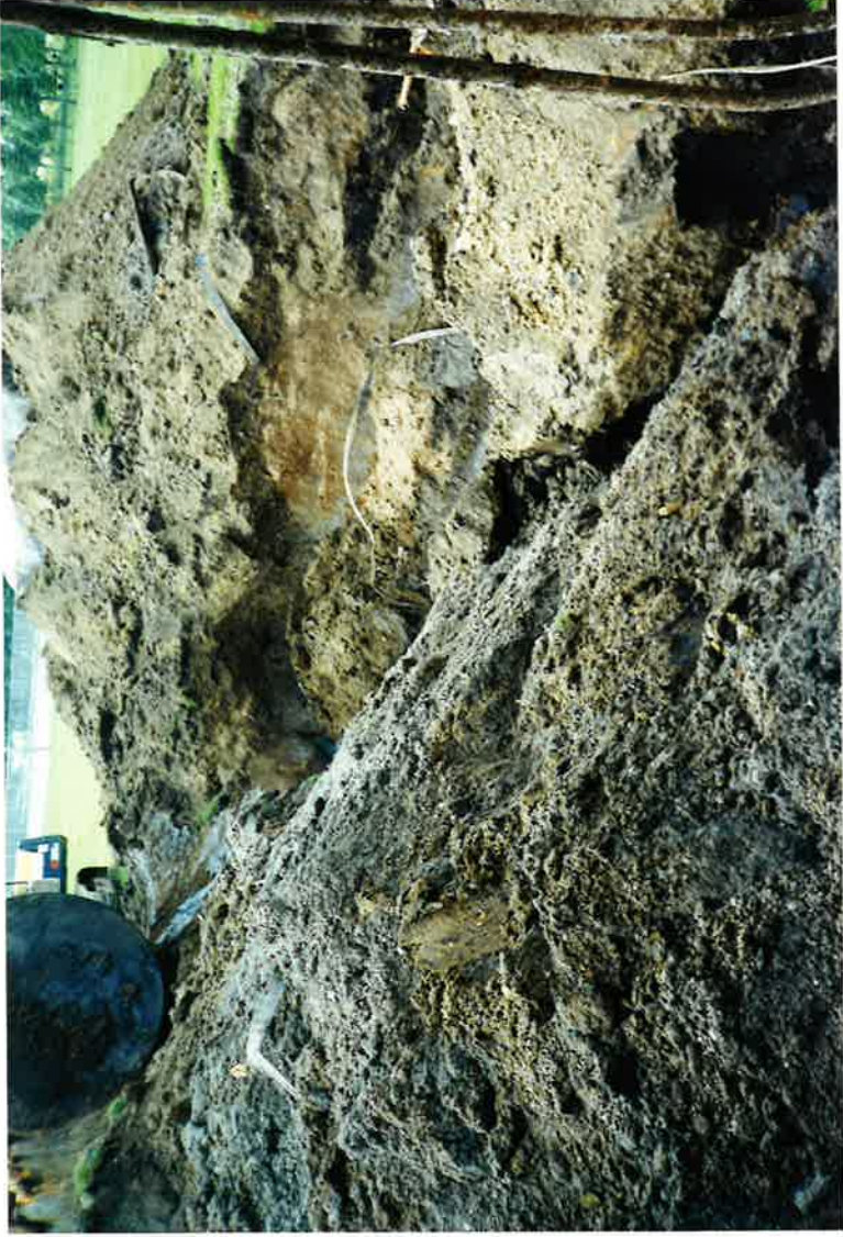
Martin County West High School Removed 6,000 gallon and Removed 10,000 gallon tank excavation