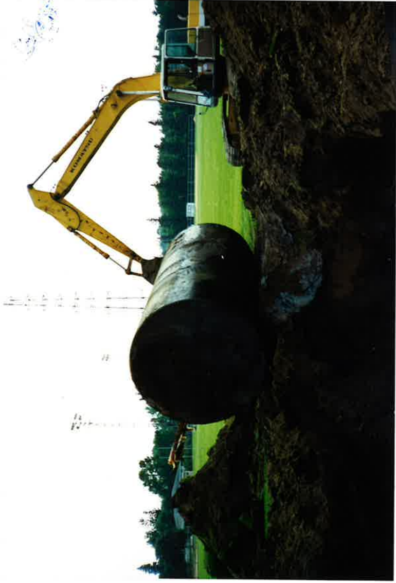
Martin County West High School Removed 10,000 gallon tank