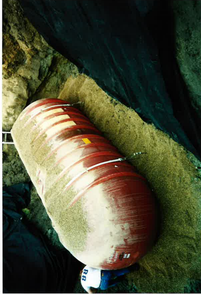
Martin County West High School Installed 6,000 gallon tank - filter fabric/pea rock