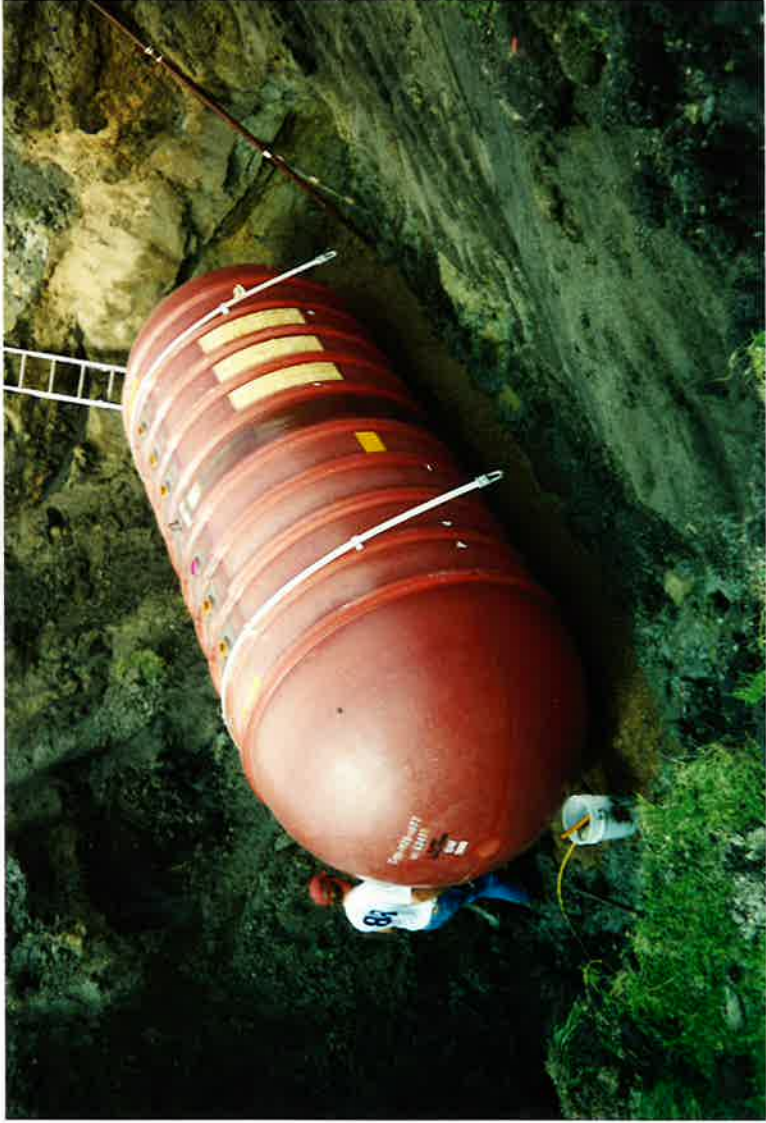
Martin County West High School Installed 6,000 gallon tank - initial placement