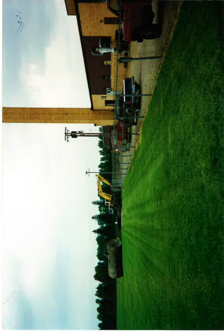
Martin County West High School West side