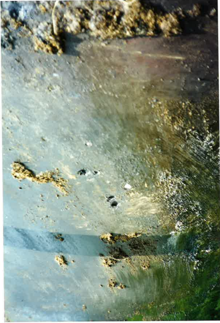
Martin County West High School Removed 6,000 gallon tank - visible pitting on bottom