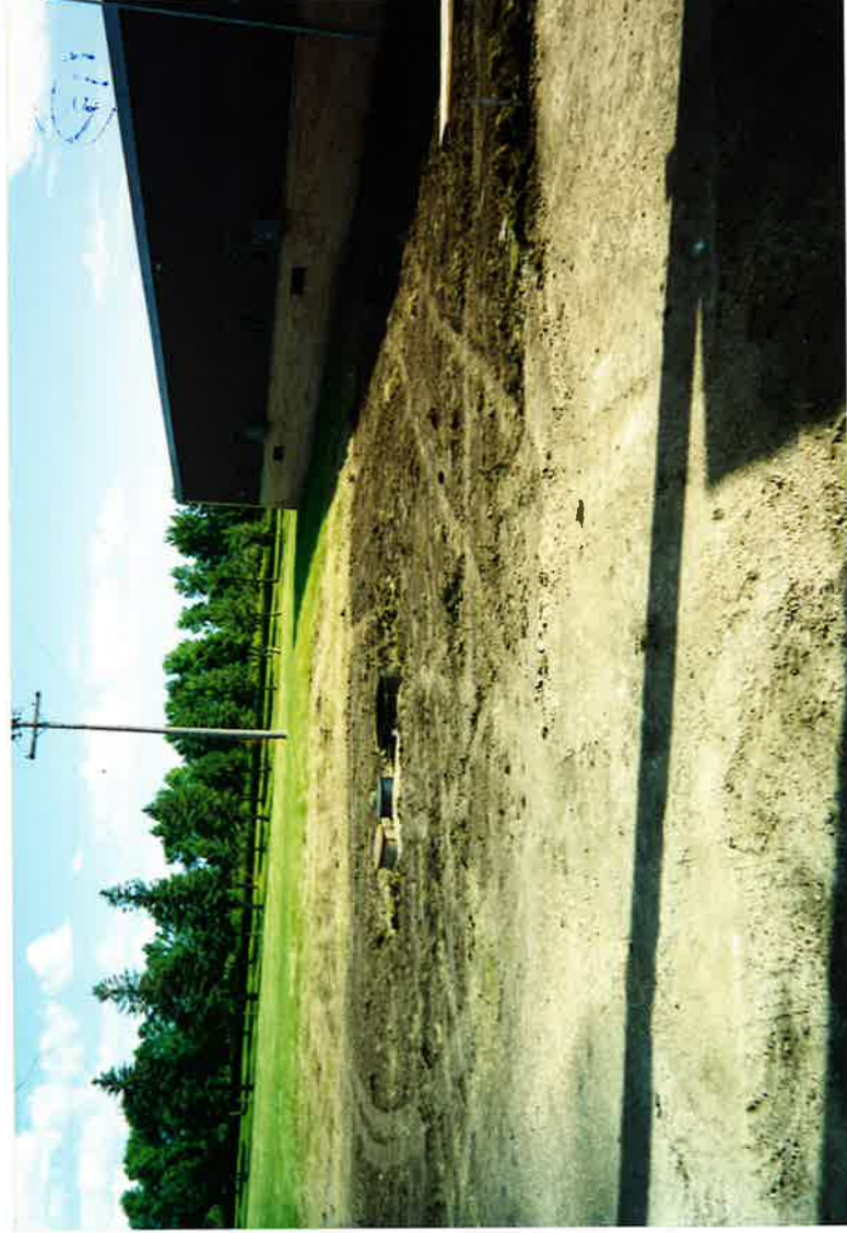
Martin County West High School Installed 6,000 gallon tank - final grade