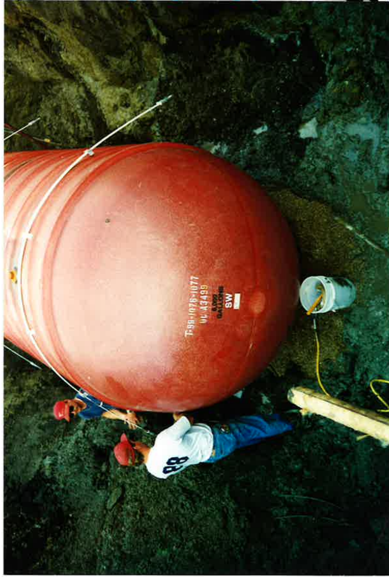
Martin County West High School Installed 6,000 gallon tank - information on east end