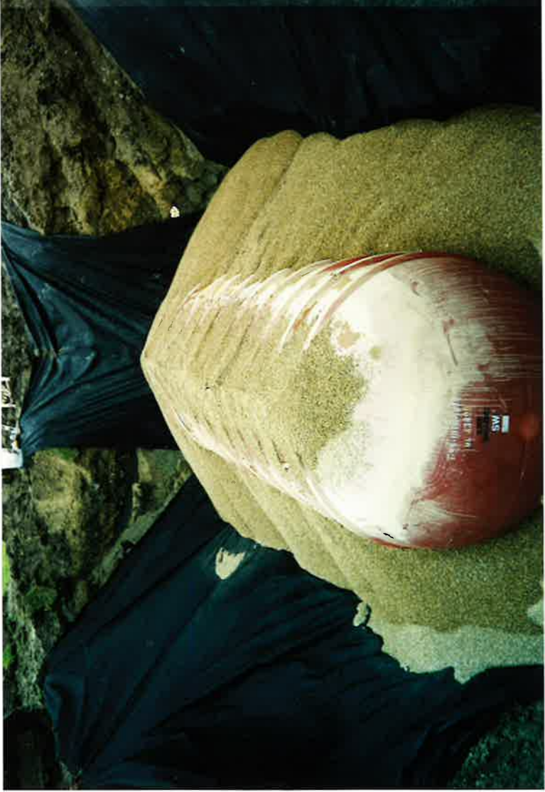
Martin County West High School Installed 6,000 gallon tank - filter fabric/pea rock