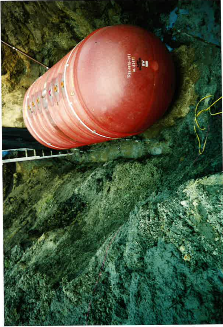
Martin County West High School Installed 6,000 gallon tank - hold-down straps secured to existing 10,000 gallon hold-down concrete pad