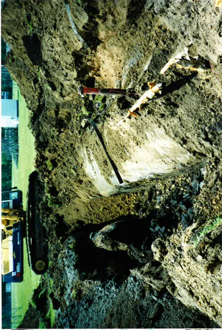
Martin County West High School South side of removed 10,000 gallon tank