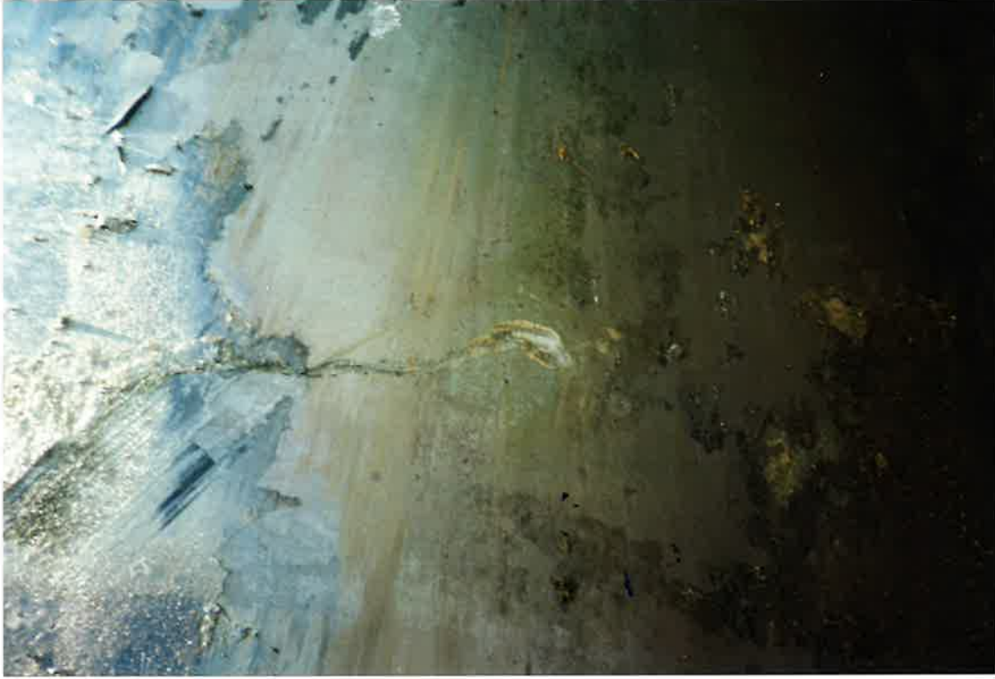
Martin County West High School Removed 10,000 gallon tank No visible pitting