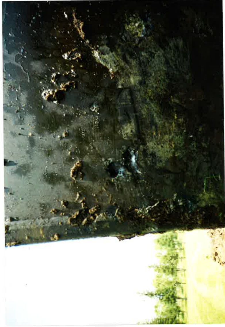
Martin County West High School Removed 6,000 gallon tank - 3/8 inch hole on bottom - west end